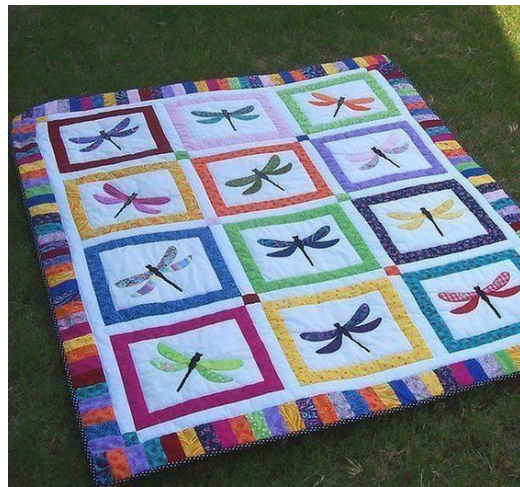
Piano Key Border

Scrappy strip pieced border. Use a strip of all the fabrics in your quilt in random width strips. Sew strip sets together and cut to size.